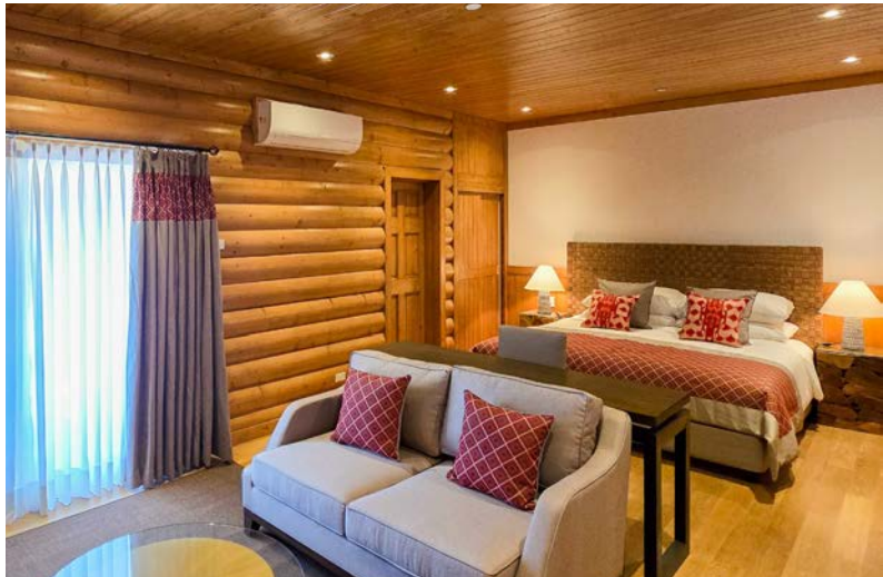
Junior Suite Room