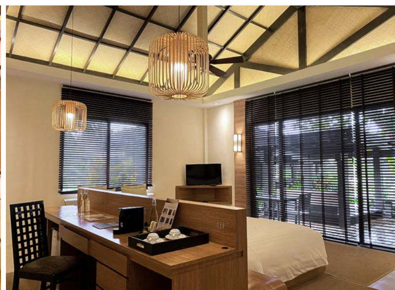
Refreshed Balesin Village villa